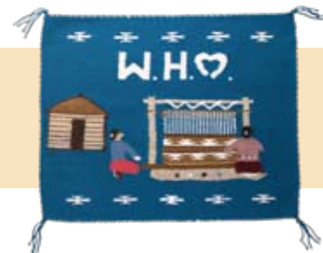
Rug specially designed by the Elders for the WHO Foundation.